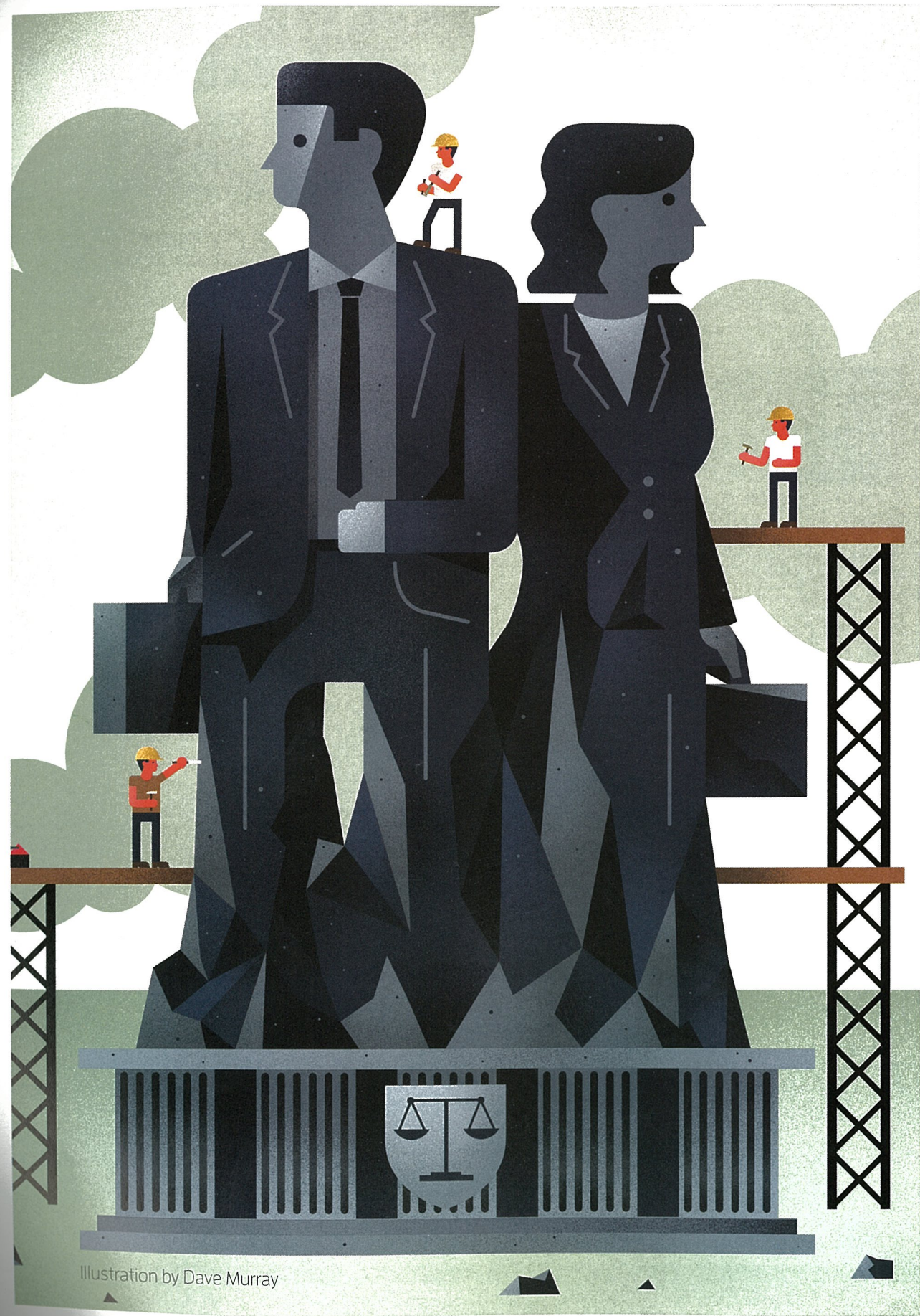
Illustration by Dave Murray