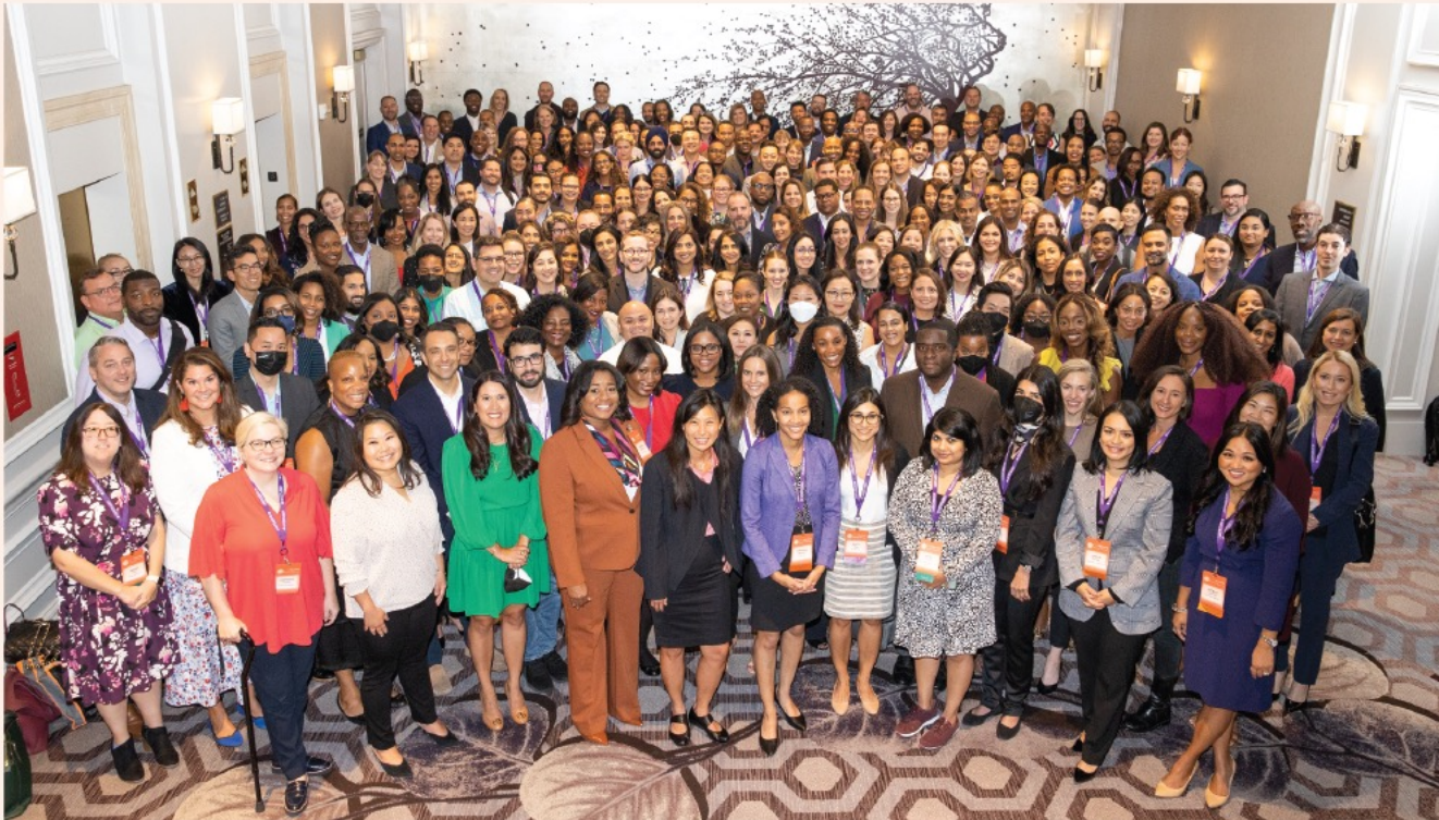
2022 Fellows at their Fall Meeting in Washington, DC