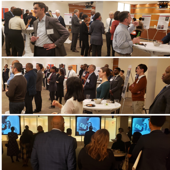
A Celebration of D.C. Black History, February 6, 2020